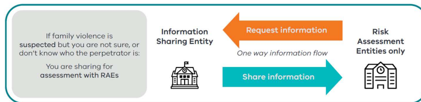
Figure 1: Overview of activities when sharing information for risk assessment

Family violence risk assessment is an ongoing process and is required at different points in time from different service perspectives. Education and care services will have a role in working collaboratively with other services to contribute to ongoing risk assessment and management of family violence.